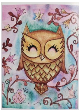
Here is a card Janeen Whetstone made