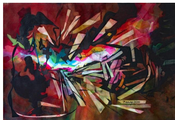
Tilting at Windmills

On my painting easel is this phrase that describes my journey :