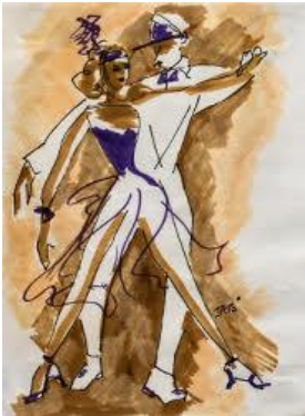
Love to Dance