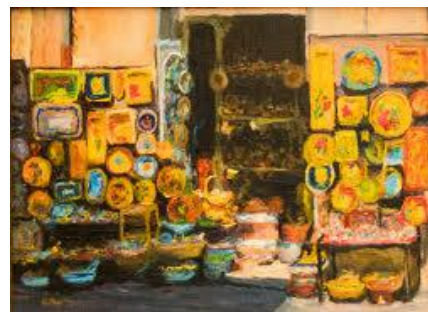
Pottery Shop in Assisi