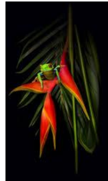
Red Eyed Frog on Heliconia