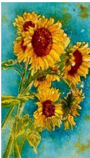
Kathy Mantel "Sunflowers" Watercolor Batik 5/9