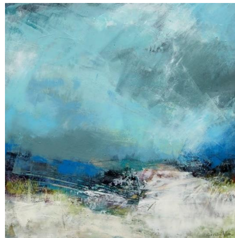
Cindy Vener Oil and Cold Wax 5/23