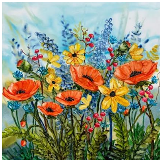
Korinne Carpino "Spring Flowers" Alcohol Ink 5/30