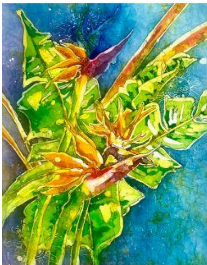
Kathy Mantel "Bird of ParadisE" Watercolor Batik 5/9