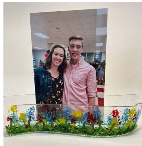
Ann Dotzhauer "Stand Up Picture Frames" Three Fused Glass Frames 6/13