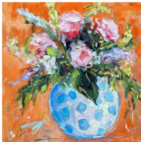
Cindy Vener "Floral Still Life" Acrylic 5/30