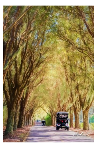
Betty Eich - "Tunnel of Trees