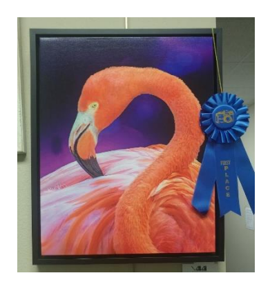
Photography 1st Pl: Diane Pattie - "Flaming Flamingo"