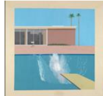
A Bigger Splash David Hockney