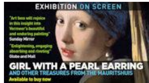
Girl With the Pearl Earring – Thursday June 20 th @ 4:00pm