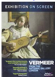
Vermeer – Thursday July 11 th @ 4:00pm