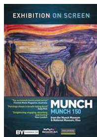
Munch – Tuesday July 23 rd @ 4:00pm