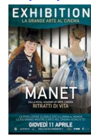
Manet – Monday July 29 th @ 4:00pm