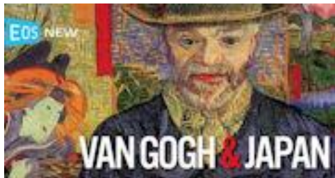
Van Gogh and Japan – Thursday June 13 th @ 1:00pm and Monday June 17 th @ 1:00pm

The Rialto has released its schedule of Exhibition on Screen art movies for the summer! Some are returning hits; others are new to The Villages. These are great movies, entertaining and educational, and The Rialto supports the VAA Scholarship Fund with a percentage of ticket sales. Click on the links below to see a preview.