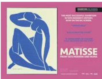
Matisse – Thursday June 27 th @ 4:00pm