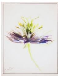
1 st Place Photo, Eileen Sklon Dance of the Nigella