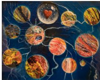
2 nd Place, Doris Glapion Family Connection